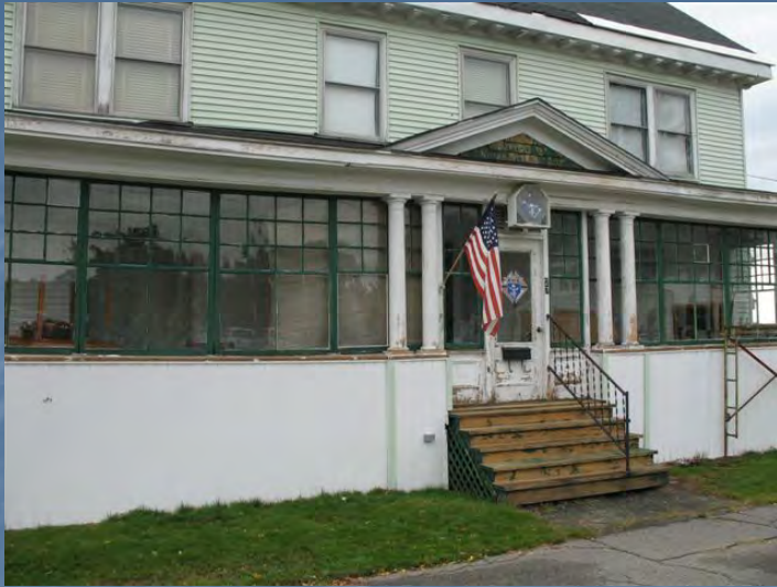
Member Knights of Columbus