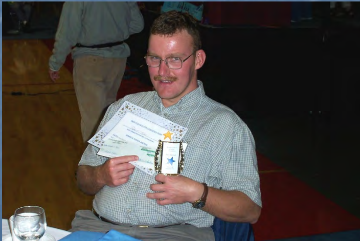
Advocate and Public Speaker