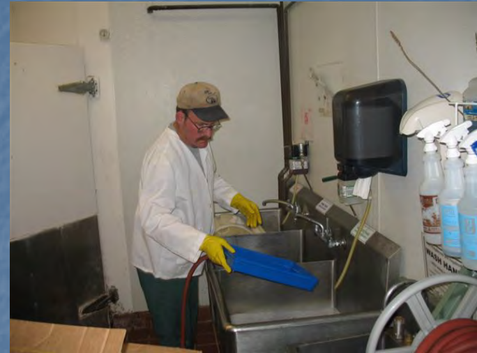
Works 12 hrs/wk