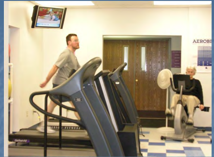
Member of Lifestyle Fitness Center