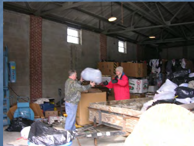
Volunteers 20 hrs/wk; receives 21 home support and 4 community support hrs/wk