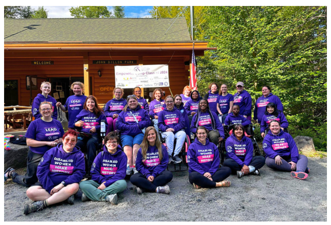
Early Action Deadline - Feburary 24th, 2024 at 11:59pm ET Main Application Deadline - April 13, 2024 at 11:59pm ET Adirondacks Trip: August 4th- 9th, 2024 Reunion trip, Washington, DC: July 2025

Each year disabled young women from across the United States are invited to the Adirondacks for one week to have fun, connect with other disabled girls, connect with mentors, and learn about disaster preparedness, all while developing leadership skills. Girls meet again in Washington, D.C. the next summer for an exciting reunion trip to reconnect with friends and explore how they have grown as leaders. During the year between the camping trip and the reunion trip, girls work on a year-long local project involving inclusive disaster strategies and check in with their mentor monthly. Mentors help the girls with the project, school, and disability issues, while empowering the girls to achieve their goals and continue setting bigger goals for the future.